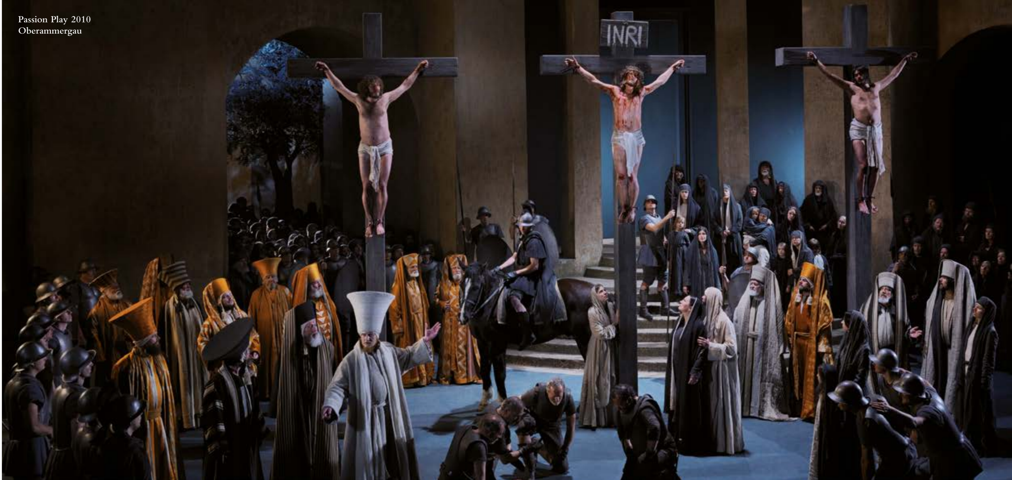
Passion Play 2010 Oberammergau

All actors of the world's largest amateur dramatic performance come from the village, since a special play law is in effect. All participants, from actors playing the big speaking parts such as Jesus, Mary or Judas, through members of the choir, orchestra members, firemen and ushers, must have been born in Oberammergau or lived there for at least 20 years.